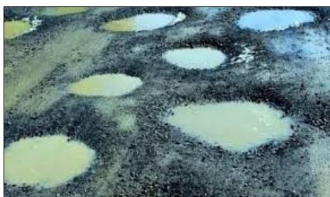
Figure 3: Puddles