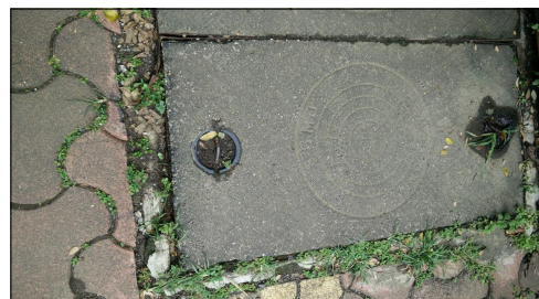
Figure 2: Drainage cover