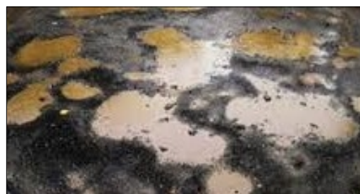
Figure 4: Puddles