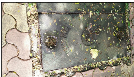
Figure 1: Drainage cover

After the task of locating and collecting a sample, teachers can facilitate students in preparing slides and observing them under the microscope. Teachers may need to help the students in aligning the slides, focusing with the appropriate objective lens, seeing through the eyepiece, light adjustment, the total magnification at which they are observing, the visual field in which they are observing, etc.