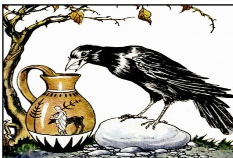
Figure 1: The Crow and the Pitcher

Do you remember the childhood fable of the crow and the pitcher? (See figure 1.) In this unit, we will imitate the crow in the story and use the concept that ‘a body submerged in water displaces an amount of water equivalent to its volume’, to carry out some measurements. The last task in this unit is closely related to the tale — and you may reach a surprising conclusion at the end of it!