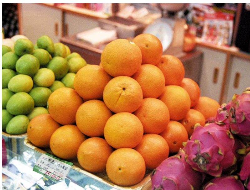
Figure T3: Fruits stacked in a fruit stall