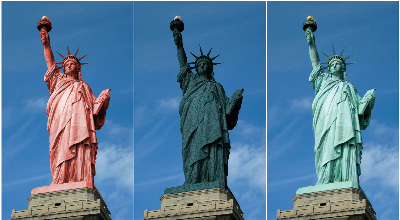
Image 3 Statue of Liberty and its transition from the original (an artist's reproduction of how it would have looked like in 1886, left) to its transition state (middle) to the latest image (right)

It is almost impossible to guess that this statue might be made of copper from its appearance/look.