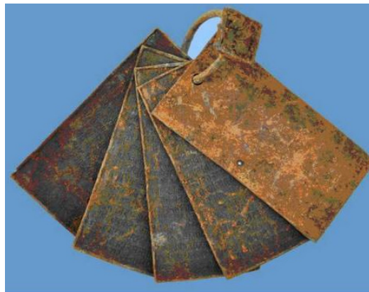
Image 2: Statue of Buddha discovered in Sultanganj, Bihar (left). Copper plates of Kalachuri dynasty (right)