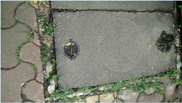
Figure 1 Drainage Cover