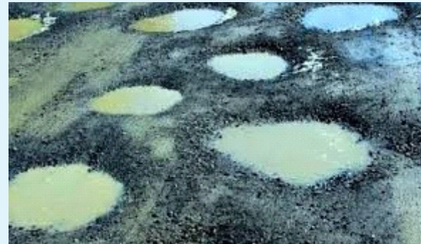
Figure 4 Puddles