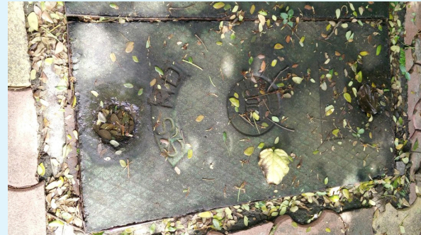
Figure 2 Drainage Cover