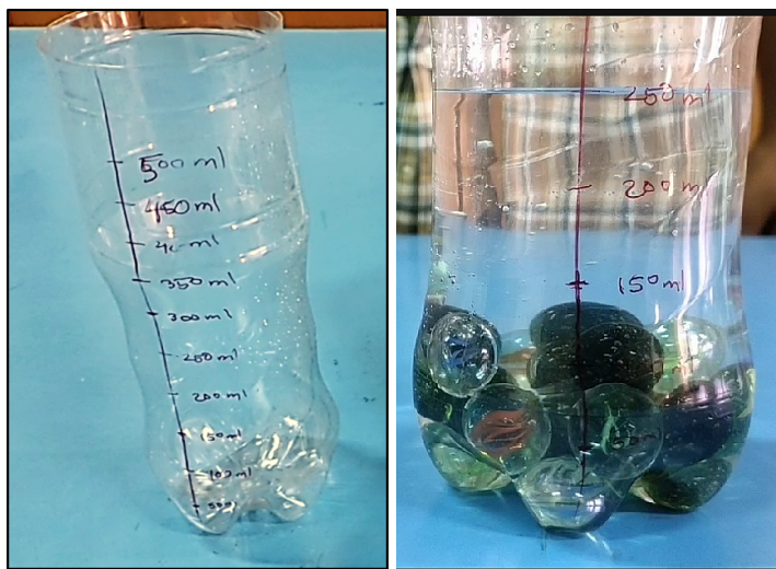
Figure 2: (Left) A measuring cylinder and (right) A measuring cylinder with water and marbles