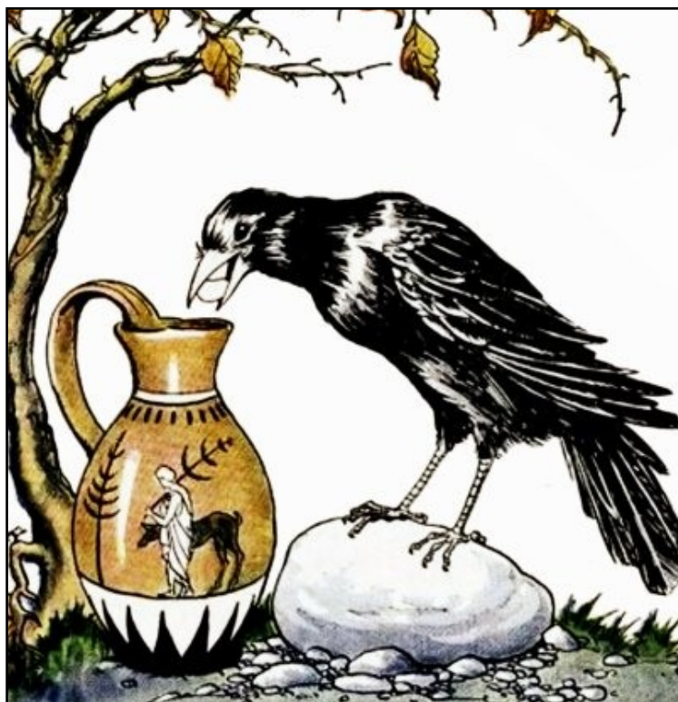
Figure 1: The Crow and the Pitcher

Do you remember the childhood fable of the crow and the pitcher? (See figure 1.) In this unit, we will imitate the crow in the story and use the concept that ‘a body submerged in water displaces an amount of water equivalent to its volume’, to carry out some measurements. The last task in this unit is closely related to the tale — and you may reach a surprising conclusion at the end of it!