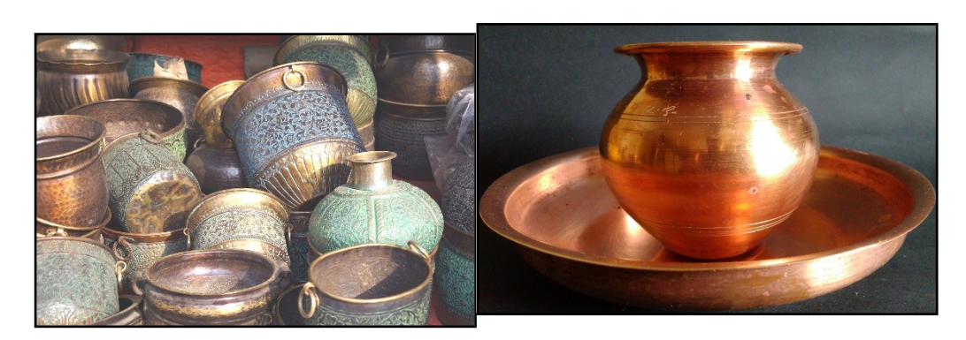
Figure 1: Copper vessel used for household purposes.

Copper has been a very important metal in the evolution of human civilization. In history books, we have read that extraction and use of metals led to the end of Stone Age. Use of metal tools started with copper from roughly 5000 BC. The use of copper was known in almost all sites of ancient civilizations like the Egyptian, Chinese, Mesopotamian, Native American, and Indian. In India, several ancient copper tools, coins and weapons are found, which tell us about the flourishing copper industry in ancient India. Some notable examples are the hoards found in the Gungeria village (Madhya Pradesh), the huge copper statue of Buddha discovered in Sultanganj (Bihar) (dated between 500 and 700 CE) and the copper plates of Kalachuri dynasty (12th century CE, Karnataka). The modern era of copper industry in India started in 1967 with the formation of Hindustan Copper Limited by the Government of India. Many regions of India have deposits of copper minerals, from where it is mined.